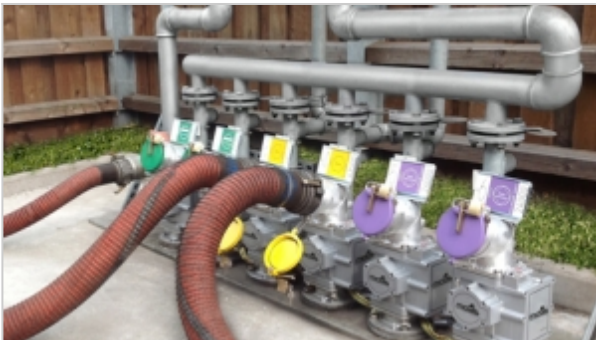
MIDAS from Berrys ensures misfuel/crossover prevention in all conditions.

The recent occurrences of UK forecourt misfuels/crossovers has led to a noticeable increase in enquiries at Berrys for its MIDAS misfuel prevention system.