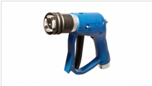
OPW's BNA-300 Nozzle For LPG Fuelling

As oil prices rise globally, increasing the price of traditional liquid fuels, European cities are establishing timelines to restrict or ban diesel outright. The focus is shifting to low emission, sustainable and renewable fuels, and the transportation industry is responding in kind.