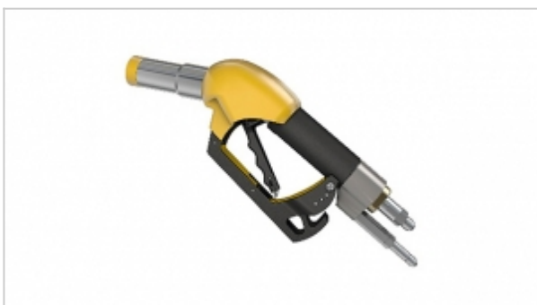
OPW's Pistol Grip Self-Service Nozzle For CNG Fuelling

"Methane contains less carbon, is not toxic and cannot contaminate groundwater. It's the ideal alternative to replace diesel for commercial vehicles. OPW offers a high quality reliable range of fuelling equipment to enable a rapid and easy transition from diesel to clean fuels".